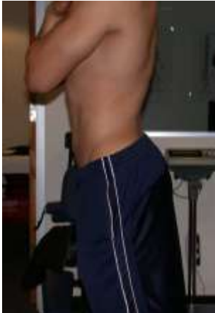
Anterior Pelvic Tilt